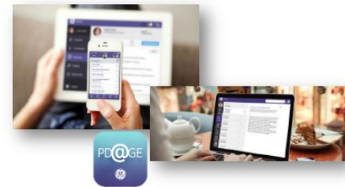
New PD@GE Tool

From labeling people to recognizing impact